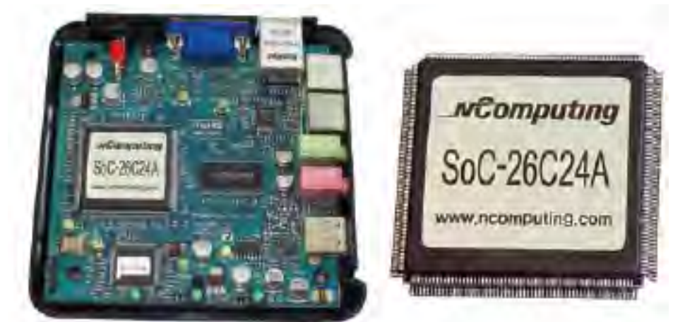
The NComputing System-on-Chip (SoC) is at the heart of each access device