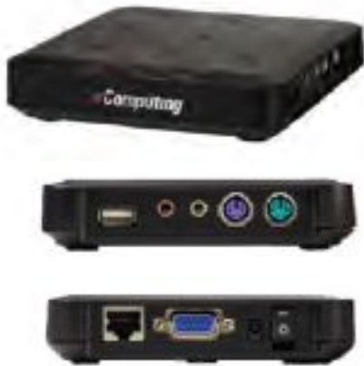
L-series access device

The SoC in the access device executes several processes including boot management, initialization, network connection, protocol decoding, bitmap cache acceleration, and administration. This approach results in access devices with very low power requirements (less than 5 watts). This enables significant power savings when compared to individual PCs that draw over 100 watts each.