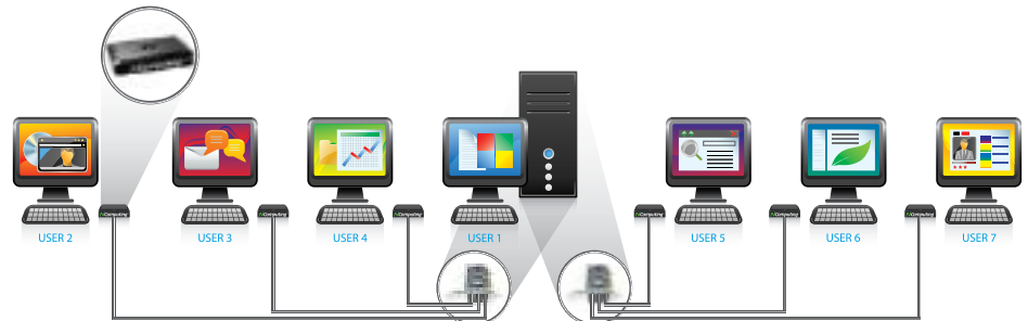
X-series configuration – direct connection

The following diagrams show how the L-series and X-series access devices connect to the shared PC.